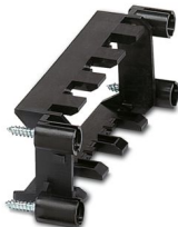
Sleeve frame, Range of articles: VARIOCON, design: VC1, housing material: Polyamide, color: black

Please be informed that the data shown in this PDF document is generated from our online catalog. Please find the complete data in the user documentation. Our general terms of use for downloads are valid.