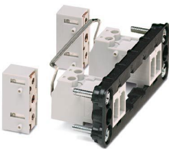
Panel mounting frame, with capacitive PE, for contact insert modules, type 1, number of insert modules 2

Please be informed that the data shown in this PDF document is generated from our online catalog. Please find the complete data in the user documentation. Our general terms of use for downloads are valid.