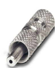
Fiber optic contact insert, Range of articles: VARIOCON, design: FSMA, housing material: Nickel silver, color: light grey, number of positions: 1

Please be informed that the data shown in this PDF document is generated from our online catalog. Please find the complete data in the user documentation. Our general terms of use for downloads are valid.