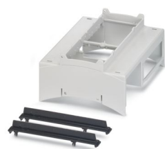
DIN rail housing for Raspberry Pi computers (suitable for Raspberry Pi A+, B+, B2, B3, B4); set consisting of upper part, cover and PCB retainer; housing in accordance with DIN 43880

Please be informed that the data shown in this PDF document is generated from our online catalog. Please find the complete data in the user documentation. Our general terms of use for downloads are valid.