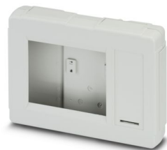
Display housing, 5.7", light gray, consisting of two half shells, four front plates with screws and battery pack contacts, window on the left. Front 1.1 mm recessed, keypad area on the right, recessed for battery pack

Please be informed that the data shown in this PDF document is generated from our online catalog. Please find the complete data in the user documentation. Our general terms of use for downloads are valid.