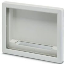
Display housing, 15", light gray, central window, front level, with cutout for connection technology angle plate consisting of two half shells with screws

Please be informed that the data shown in this PDF document is generated from our online catalog. Please find the complete data in the user documentation. Our general terms of use for downloads are valid.