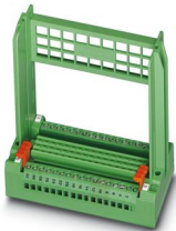
19" plug-in card block, number of positions: 32, product range: SKBI 32, pitch: 5.08 mm, type of packaging: packed in cardboard

Please be informed that the data shown in this PDF document is generated from our online catalog. Please find the complete data in the user documentation. Our general terms of use for downloads are valid.