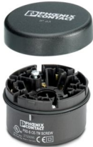
Connection element with screw connection terminal blocks for tube mounting

Please be informed that the data shown in this PDF document is generated from our online catalog. Please find the complete data in the user documentation. Our general terms of use for downloads are valid.