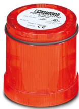
LED permanent light element, 24 V AC/DC, red

Please be informed that the data shown in this PDF document is generated from our online catalog. Please find the complete data in the user documentation. Our general terms of use for downloads are valid.