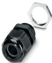
M16 cable threaded joint x 1.5 mm, black

Please be informed that the data shown in this PDF document is generated from our online catalog. Please find the complete data in the user documentation. Our general terms of use for downloads are valid.