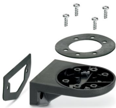
Angle for base mounting, concealed cable routing, black

Please be informed that the data shown in this PDF document is generated from our online catalog. Please find the complete data in the user documentation. Our general terms of use for downloads are valid.