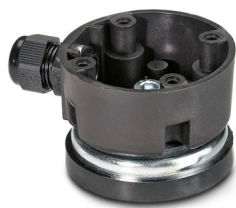
Outlet box with magnetic base for base mounting, black

Please be informed that the data shown in this PDF document is generated from our online catalog. Please find the complete data in the user documentation. Our general terms of use for downloads are valid.