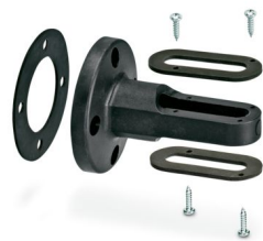
Angle for two-sided floor mounting, concealed cable routing, black

Please be informed that the data shown in this PDF document is generated from our online catalog. Please find the complete data in the user documentation. Our general terms of use for downloads are valid.