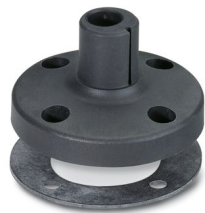
Foot for tube Ø 25 mm, plastic, black

Please be informed that the data shown in this PDF document is generated from our online catalog. Please find the complete data in the user documentation. Our general terms of use for downloads are valid.