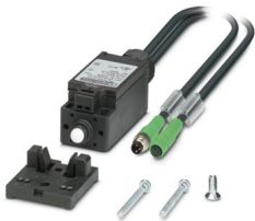
Door position switch with 1 m cable with M8 plug and 0.6 m cable with M8 socket (Snap-in), including mounting accessories

Please be informed that the data shown in this PDF document is generated from our online catalog. Please find the complete data in the user documentation. Our general terms of use for downloads are valid.