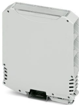
DIN rail housing, Complete housing with metal foot catch, tall design, with vents, width: 22.6 mm, height: 99 mm, depth: 113.65 mm, color: light grey (7035), cross connection: DIN rail connector (optional), number of positions cross connector: 5

Please be informed that the data shown in this PDF document is generated from our online catalog. Please find the complete data in the user documentation. Our general terms of use for downloads are valid.