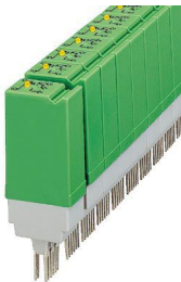
Relay connector, equipped with miniature switching relay, contacts (AgNi): medium to large loads, 1 changeover contact, input voltage 230 V AC, with LED display, pluggable into basic terminal blocks

Please be informed that the data shown in this PDF document is generated from our online catalog. Please find the complete data in the user documentation. Our general terms of use for downloads are valid.