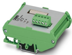
Converter board for FL IF ... interface module

Please be informed that the data shown in this PDF document is generated from our online catalog. Please find the complete data in the user documentation. Our general terms of use for downloads are valid.