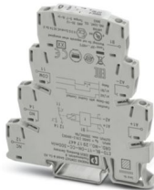
Timer relay with switch-on delay (with control contact) and an adjustable time range (3 min - 300 min), with screw connection

Please be informed that the data shown in this PDF document is generated from our online catalog. Please find the complete data in the user documentation. Our general terms of use for downloads are valid.