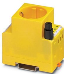
Rail-mountable socket, with glow lamp and equipment fusing 5 x 20 mm to max. 6.3 A; yellow housing

Please be informed that the data shown in this PDF document is generated from our online catalog. Please find the complete data in the user documentation. Our general terms of use for downloads are valid.