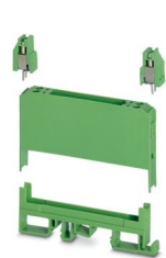
Electronic housing set, consisting of electronic housings and printed circuit termination blocks

Please be informed that the data shown in this PDF document is generated from our online catalog. Please find the complete data in the user documentation. Our general terms of use for downloads are valid.