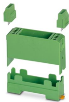
Electronic housing set, consisting of electronic housing and printed circuit termination blocks, pitch 5

Please be informed that the data shown in this PDF document is generated from our online catalog. Please find the complete data in the user documentation. Our general terms of use for downloads are valid.