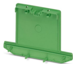
Side element, tall version, for closing both ends of the base element UM-BEFE, for 73 mm wide U-shaped profile cover

Please be informed that the data shown in this PDF document is generated from our online catalog. Please find the complete data in the user documentation. Our general terms of use for downloads are valid.