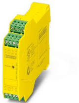
Safe coupling relay with force-guided contacts, 5 N/O contacts, 2 N/C contacts, 1-channel, width: 22.5 mm, pluggable Push-in terminal block

Please be informed that the data shown in this PDF document is generated from our online catalog. Please find the complete data in the user documentation. Our general terms of use for downloads are valid.