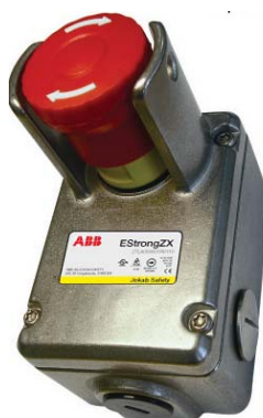
Stainless steel with protection shroud and padlock holes