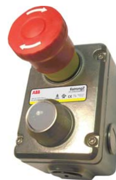
Stainless steel with 2 color LED