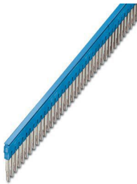
Plug-in bridge, pitch: 5.2 mm, number of positions: 50, color: blue

Please be informed that the data shown in this PDF document is generated from our online catalog. Please find the complete data in the user documentation. Our general terms of use for downloads are valid.