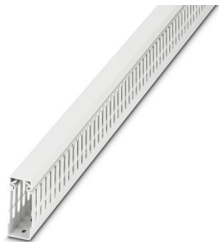
Cable duct for installation and mounting in control cabinets, white, comprising upper part and mounting base, width: 25 mm, height: 60 mm, length: 2000 mm

Please be informed that the data shown in this PDF document is generated from our online catalog. Please find the complete data in the user documentation. Our general terms of use for downloads are valid.