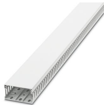
Cable duct for installation and mounting in control cabinets, white, comprising upper part and mounting base, width: 80 mm, height: 25 mm, length: 2000 mm

Please be informed that the data shown in this PDF document is generated from our online catalog. Please find the complete data in the user documentation. Our general terms of use for downloads are valid.