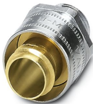
Cable gland made from brass with metric thread, rotatable, IP40 protection

Please be informed that the data shown in this PDF document is generated from our online catalog. Please find the complete data in the user documentation. Our general terms of use for downloads are valid.