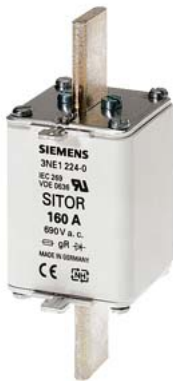
SITOR fuse link, with blade contacts, NH1, In: 160 A, gR, Un AC: 690 V, Un DC: 250 V, front indicator