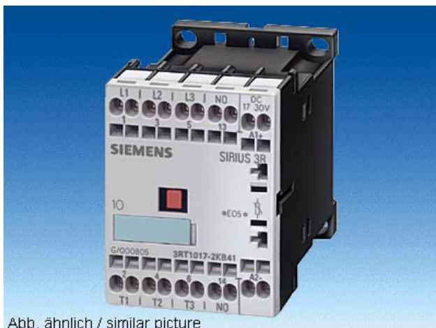
Abb. ähnlich / similar picture

CONTACTOR, AC-3 5.5 KW/400 V, 1 NC, AC 230 V, 50/60 HZ, 3-POLE, SIZE S00, CAGE CLAMP CONNECTION