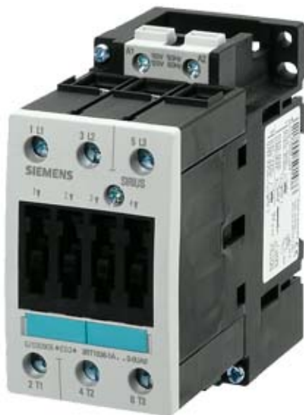
CONTACTOR, AC-3 18,5 KW/400 V, AC 208 V, 50/60 HZ, 3-POLE, SIZE S2, SCREW CONNECTION