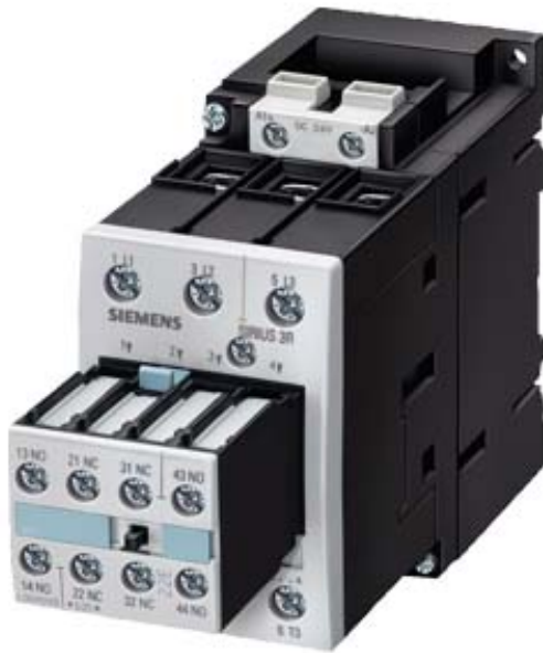
CONTACTOR, AC-3 18.5 KW/400 V, DC 24 V, 3-POLE, 2 NO + 2 NC, SIZE S2, SCREW CONNECTION