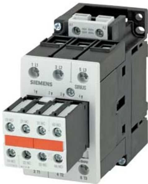
CONTACTOR, 3PH, 22 KW/400 V, 120 V AC, 60 HZ, 2NO+2NC, PERM. 3-POLE, SIZE S2, SCREW TERMINAL