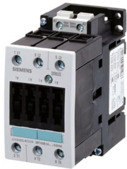
CONTACTOR, AC-3 22 KW/400 V, AC 220V 50HZ/240V 60HZ 3-POLE, SIZE S2, SCREW CONNECTION