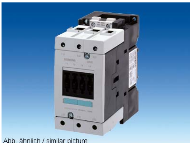
Abb. ähnlich / similar picture

CONTACTOR, AC-3 30 KW/400 V, AC 400 V, 50 HZ, 3-POLE, SIZE S3, SCREW CONNECTION