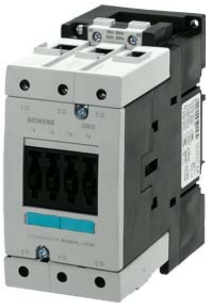
CONTACTOR, AC-3 45 KW/400 V, AC 220V 50HZ/240V 60HZ 3-POLE, SIZE S3, SCREW CONNECTION