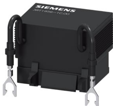
Surge suppressor (RC element) for 3RT1 S6, S10, S12 with screw terminal (drive) 400 ... 600 V AC