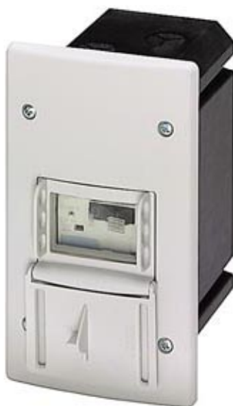
MOULDED-PLASTIC ENCLOSURE FOR FLUSH MOUNTING WITH ACTUATING MEMBRANE