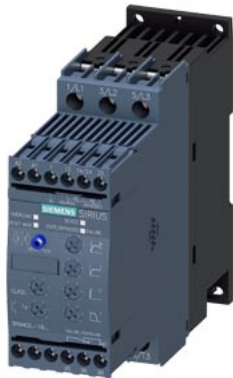
SIRIUS soft starter S0 25 A, 15 kW/500 V, 40 °C 400-600 V AC, 24 V AC/DC Screw terminals