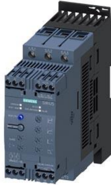
SIRIUS soft starter S2 63 A, 37 kW/500 V, 40 °C 400-600 V AC, 24 V AC/DC Screw terminals