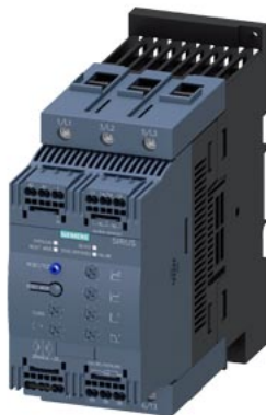
SIRIUS soft starter S3 106 A, 75 kW/500 V, 40 °C 400-600 V AC, 24 V AC/DC spring-type terminals