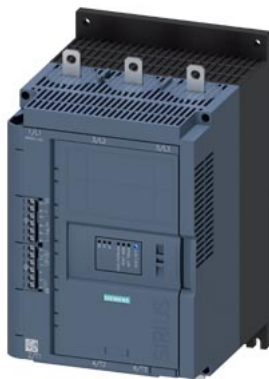
SIRIUS soft starter 200-480 V 113 A, 110-250 V AC Screw terminals Analog output