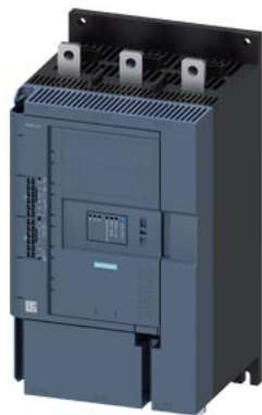
SIRIUS soft starter 200-600 V 570 A, 24 V AC/DC spring-type terminals Thermistor input