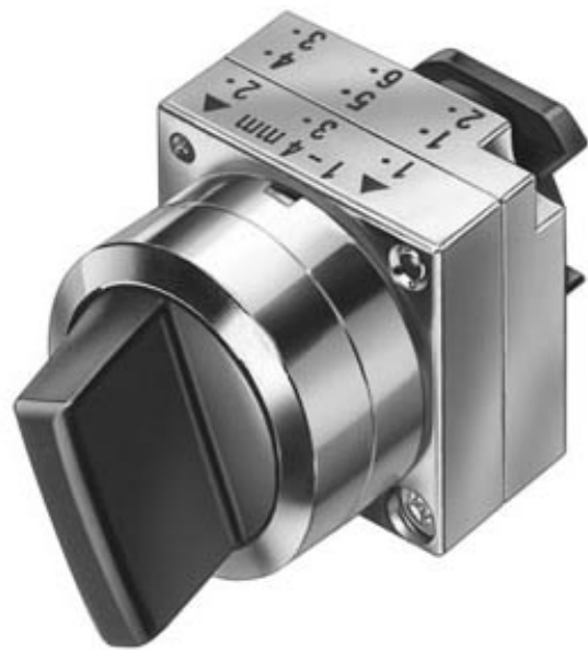
22MM METAL ROUND ACTUATOR: SELECTOR SWITCH MOMENTARY CONTACT TYPE 3 SWITCH POSITIONS I-O -II ILLUMINATED WITH HOLDER GREEN