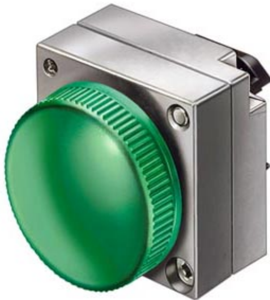
22MM METAL ROUND INDICATOR: INDICATOR LIGHT WITH SMOOTH LENSE ILLUMINABLE WITH HOLDER WHITE