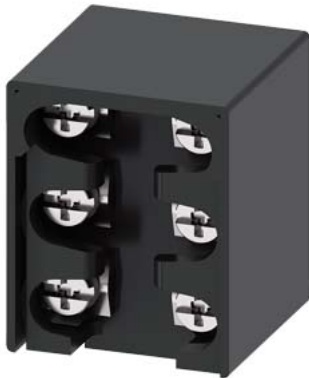
Contact block for position switch 3SE51/52 2 NO/1 NC slow-action contact