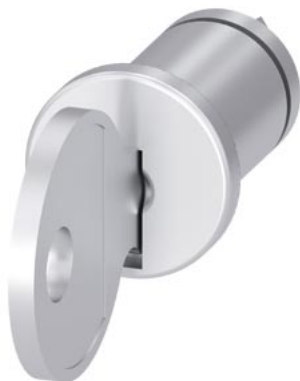
cylinder lock lock number 4