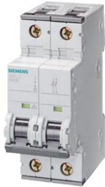
Miniature circuit breaker 400 V 10kA, 2-pole, A, 2A, D=70 mm