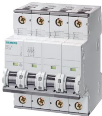
Miniature circuit breaker 400 V 10kA, 3+N-pole, B, 13 A, D=70 mm